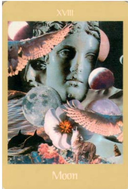
Voyager Deck by James Wanless

Tarotists skilled in the art of Tarot counseling or reading may use the cards in self-development, client assessment, and as a complementary therapy with wellness clients. Likewise, it is utilized with some mental health clients as the licensed psychotherapist gain insights into